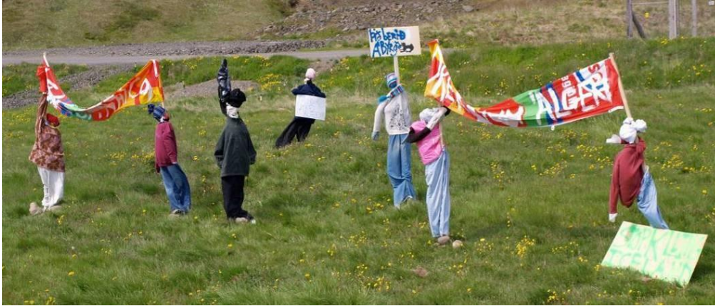
Figure 4. Demonstration at the site of Alcoa's aluminium plant.

Protestors' camps were set up in the eastern highland during construction and attempts made to disturb the project. A number of public figures were prominent in protesting the project and one of them organized a demonstration in Reykjavík 2006 with participation of some 10,000. This sheds a light on how divided the public in Iceland was on the issue.