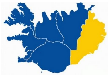
Figure 1. Regions in Iceland (East Iceland in yellow).

Eastern Iceland is the region furthest away from Reykjavík, the capital city which together with its neighbouring communities has around 63% of the Icelandic population and is the centre of the government and economy in the country. Access from Eastern Iceland to the capital region is costly and time-consuming. By air the travel time is about one hour and by road the drive is up to 8 hours. The region is characterized by many fjords surrounded with high mountains, which makes road transportation within the region challenging. The size of the region is 15,700 km 2 and 15.2% of the size of the country.