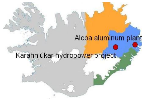
Figure 2. The location of Kárahnjúkar and Alcoa Fjarðaál.

finished it became the largest power plant in the country and important driver of the social and economic development of the region. 12